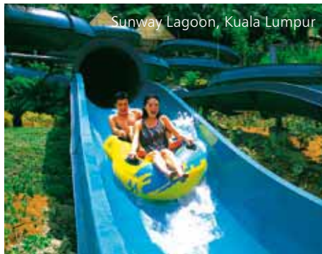
Sunway Lagoon, Kuala Lumpur