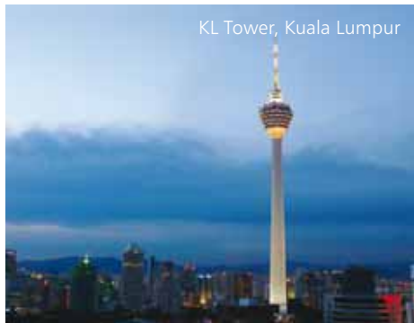
KL Tower, Kuala Lumpur