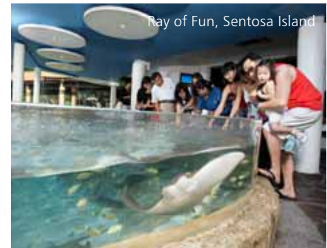
Ray of Fun, Sentosa Island