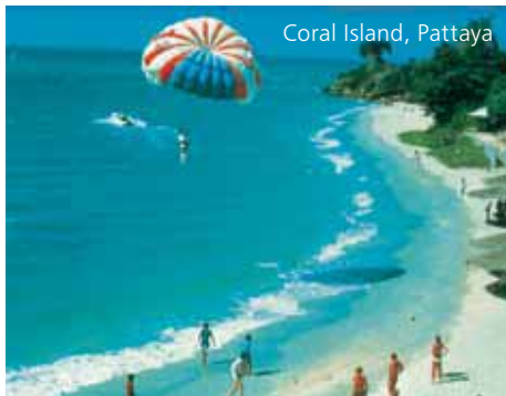
Coral Island, Pattaya