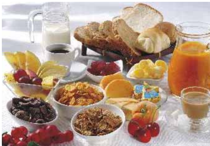
Start your day with a buffet breakfast everyday - bread, butter, jam, cheese, cereal, eggs, fruits, milk, tea, coffee and juice.

Lunches (if any) served will be vegetarian.