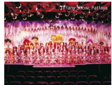
Tiffany Show, Pattaya