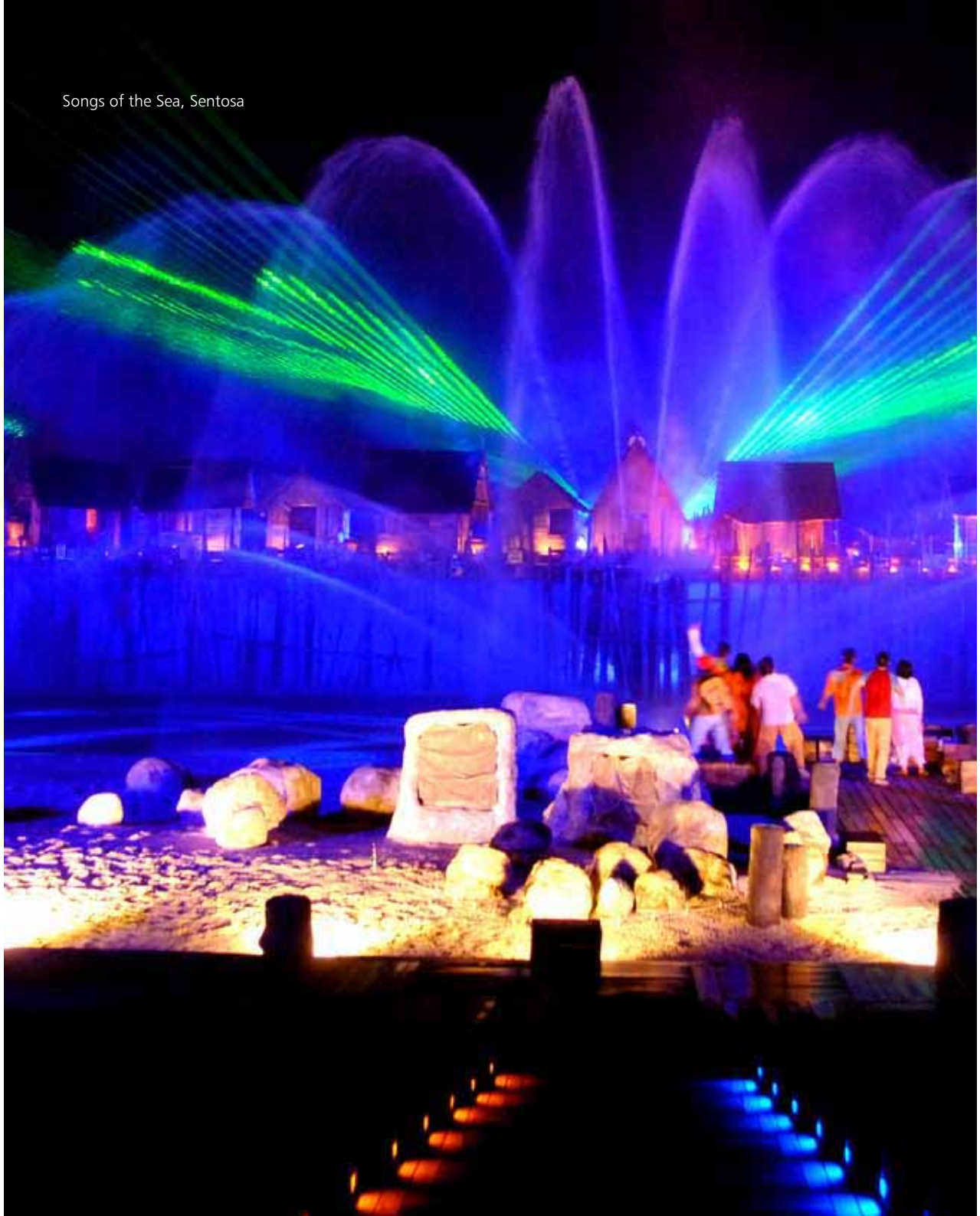
Songs of the Sea, Sentosa