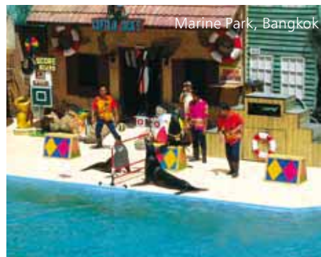
Marine Park, Bangkok