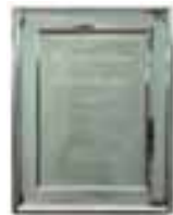
Kuala Lumpur Mayor's Tourism Awards 2011 - Award for Excellence International Tour Operator Category