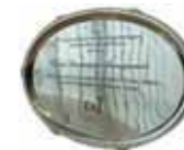
Taj Hotels Award for Outstanding Contribution in 2009-10